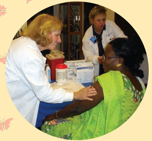
Fighting the flu! Vaccinated by Community Home Care Management, 2,835 community members were protected from influenza in FY2010 .