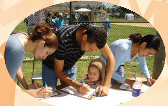
In partnership with the Latino Health Initiative, Suburban Hospital provides free cholesterol screenings to educate thousands of Ama Tu Vida participants on risk factors for cardiovascular disease.